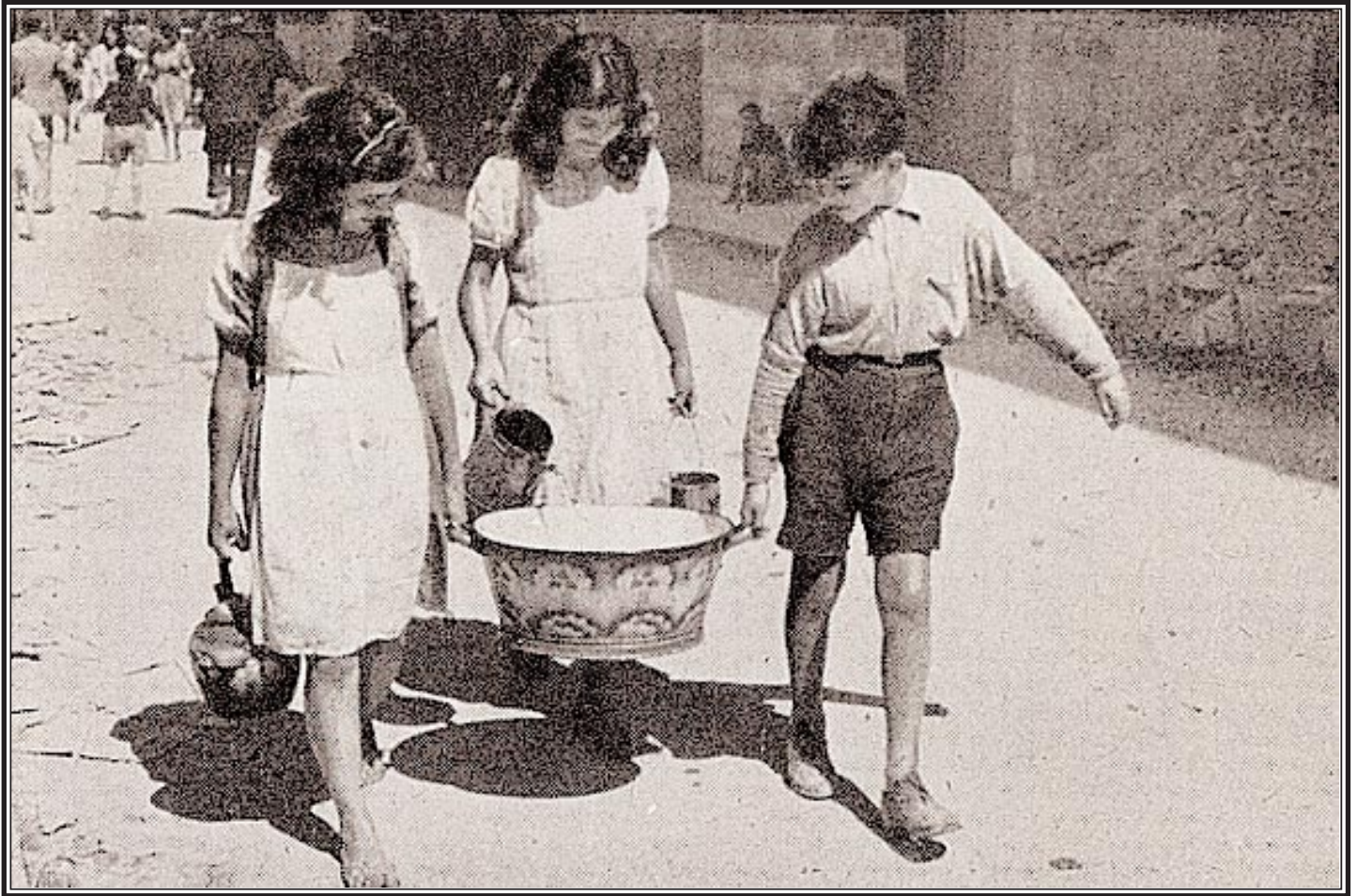
Photographs showing the effects of a bombing raid in Malta