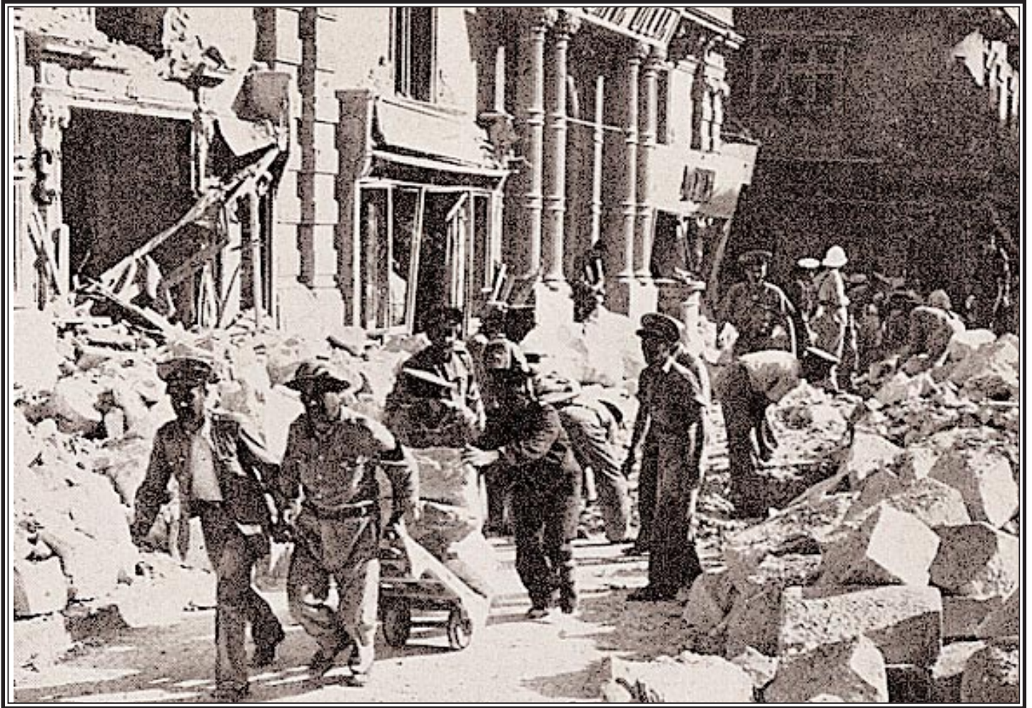
Photographs showing the effects of a bombing raid in Malta