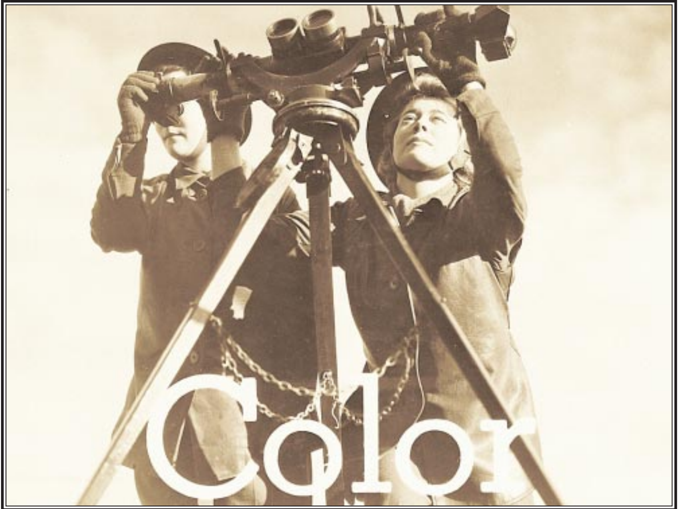
Photograph of women working as 'spotters' (spotting enemy aircraft)