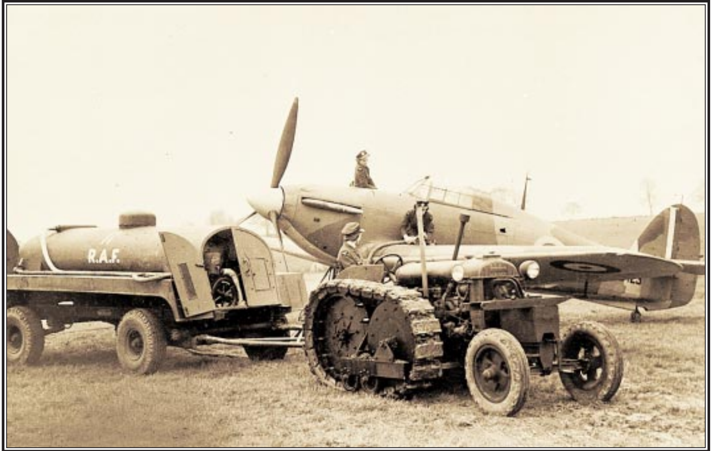
Photograph of women working on aircraft