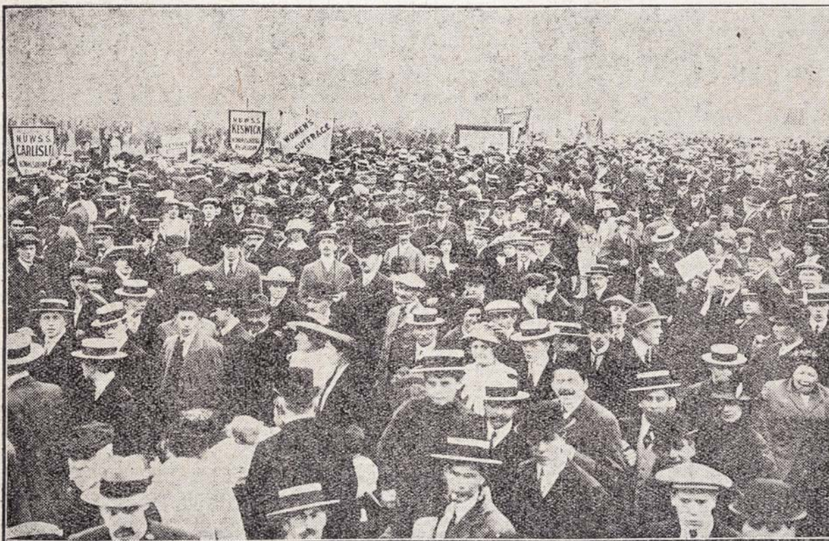
A GENERAL VIEW OF THE CROWD.