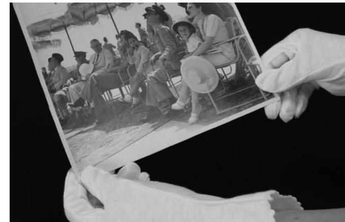
Wearing gloves will lessen the risk of damage from handling

The recommendations in this leaflet are intended as guidance only. IPC does not assume responsibility or liability.