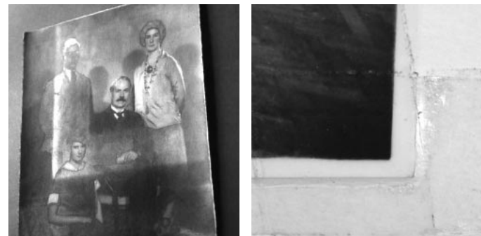
Left: Silvering or tarnishing of an image Right: Sticky tapes will cause permanent damage and should not be used on photographs