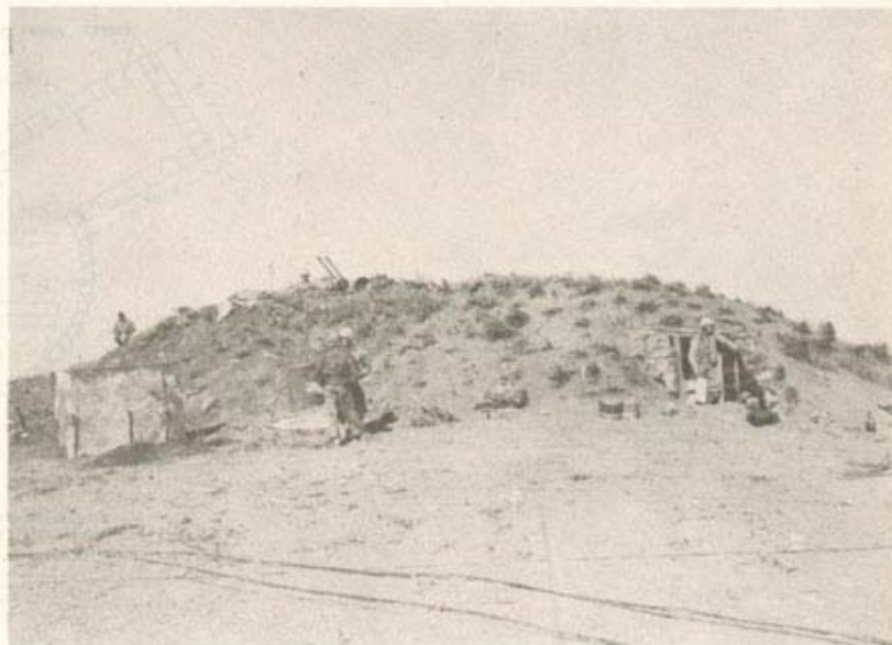
General view of earth-covered structure containing 25 mm twin-mount automatic AA position, living quarters for personnel and ammunition storage. Note the natural grass for camouflage. (TA-164E)