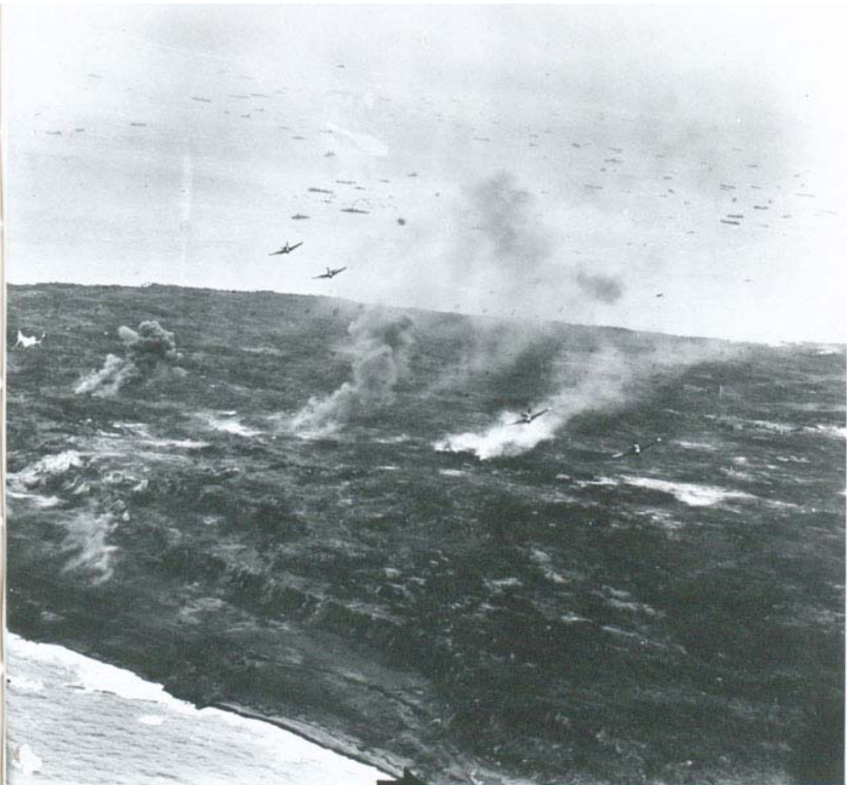
YORK 288-6 - 1030 (-10), 21 FEB. 1945 - K17-24" - ALT. 2000' IWO JIMA - A DIVISION OF F6FS ATTACKING IN SUPPORT OF THE GROUND FORCES.