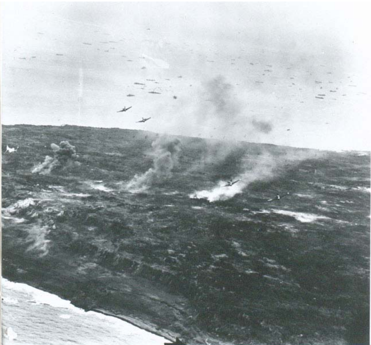
YORK 288-6 - 1030 (-10), 21 FEB. 1945 - K17-24" - ALT. 2000' IWO JIMA - A DIVISION OF F6FS ATTACKING IN SUPPORT OF THE GROUND FORCES.