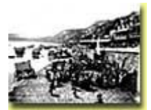
Source 4 Beach, Isle of Wight

Thomas Cook started his business in 1841, but the Great Exhibition gave him his big chance. He booked trains from all over Britain to take people to the Great Exhibition and charged them a fixed price for the return trip and the entry ticket. Overnight he had invented the 'Day Out'. As Cook's business grew he began to offer excursions to more and more places, including trips to other European countries. When Thomas Cook's son took over the family business he increased the tours abroad and offered a wider choice of excursions. Soon the railway companies began to run their own excursions.