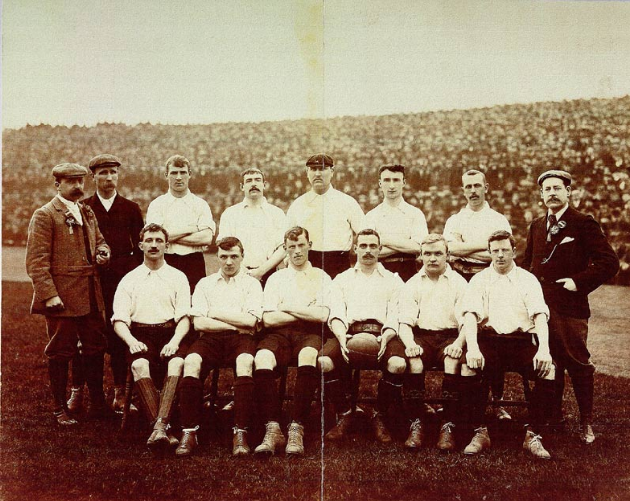
(PRO ref: COPY 1/452)