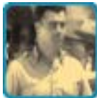
Film of the Enola Gay & photos of the explosion