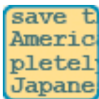
Radio broadcast by Truman, 9 August 1945