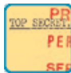
Letter from Churchill on area bombing, 1945