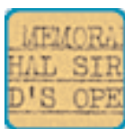
Air Ministry comments on the views of Harris