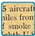
View of Arthur Harris on Dresden, 1945