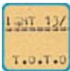
Secret reports on the attack, 14 February 1945