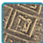
Report on results of the Dresden raid, April 1945