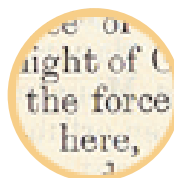
German views on the Treaty of Versailles, 1919