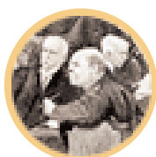
Leaders at the Peace Conference, June 1919