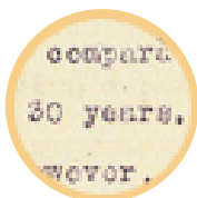
Lloyd George's views on a treaty, March 1919