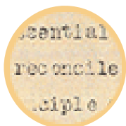
French proposals for a treaty, December 1918