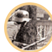
Report on the state of Germany, April 1919