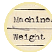
Allied aircraft, comparing 1916 to 1918