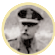
Newsreel of captured German defences, 1918