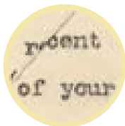
Report on the situation in France, July 1918