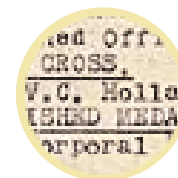
Orders sent out to troops, 1916