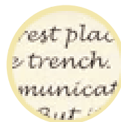
Recorded memories of life in the trenches