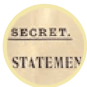
Time spent in the front line at the Somme, 1916