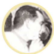
Photo of officers in their dugout, 1918