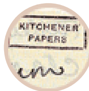
General's reports on aspects of war, 1914-15