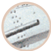
Images of tanks, 1916-18