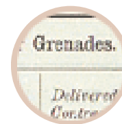
Report on trench warfare supplies, 1915