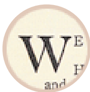
Poem called 'The Voice of the Guns', 1916