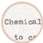
Document on impact of gas attacks, 1917