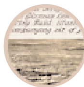
Photos of air warfare