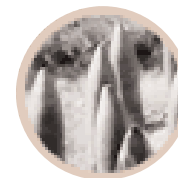
Film of artillery in action, 1916