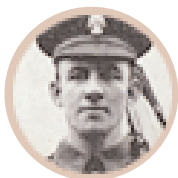
British soldier in full kit, 1915