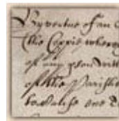
Warrant to seize all horses in London, 1643