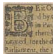
Order about paying for Parliament's army, 1644