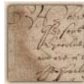
An order by Parliament about the city of Lincoln