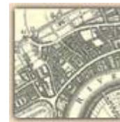
Map showing the defences of London in 1643