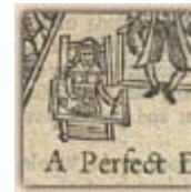
Report on Cheshire's attempt to be neutral, 1643