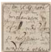
Letter from a man in the army against Scotland