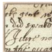
Informers' report to Archbishop Laud, 1639