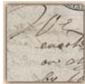
Complaint about 'ship money', 1639