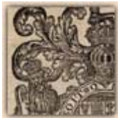
Order by Charles on playing cards & dice, 1638

The Civil War broke out in 1642, but there were many years of tension leading up to this event. How does this selection of sources from 1637-39 help us to understand why people went to war?