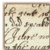
Informers' report to Archbishop Laud, 1639