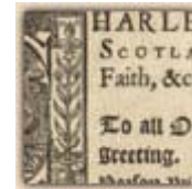
Announcement from Charles to the Scots, 1639