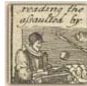
Picture of a protest in Edinburgh, 1637