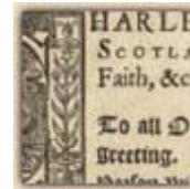
Announcement from Charles to the Scots, 1639