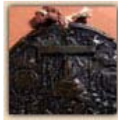
Great Seal of James I