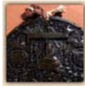
Great Seal of James I