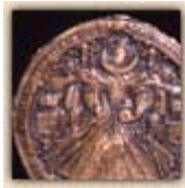
Great Seal of Elizabeth I

The two rulers who came before Charles I were Elizabeth I (1558-1603) and James I (1603-25). Studying these two rulers can help us to see whether Charles I ruled in a similar or different way. What do the sources tell us about how Elizabeth and James ruled?