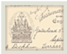
Letter on increased cost of living, 1916