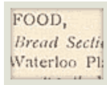
Letter encouraging food economy, 1918