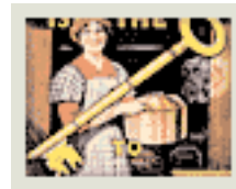
Government poster: eat less bread, 1917