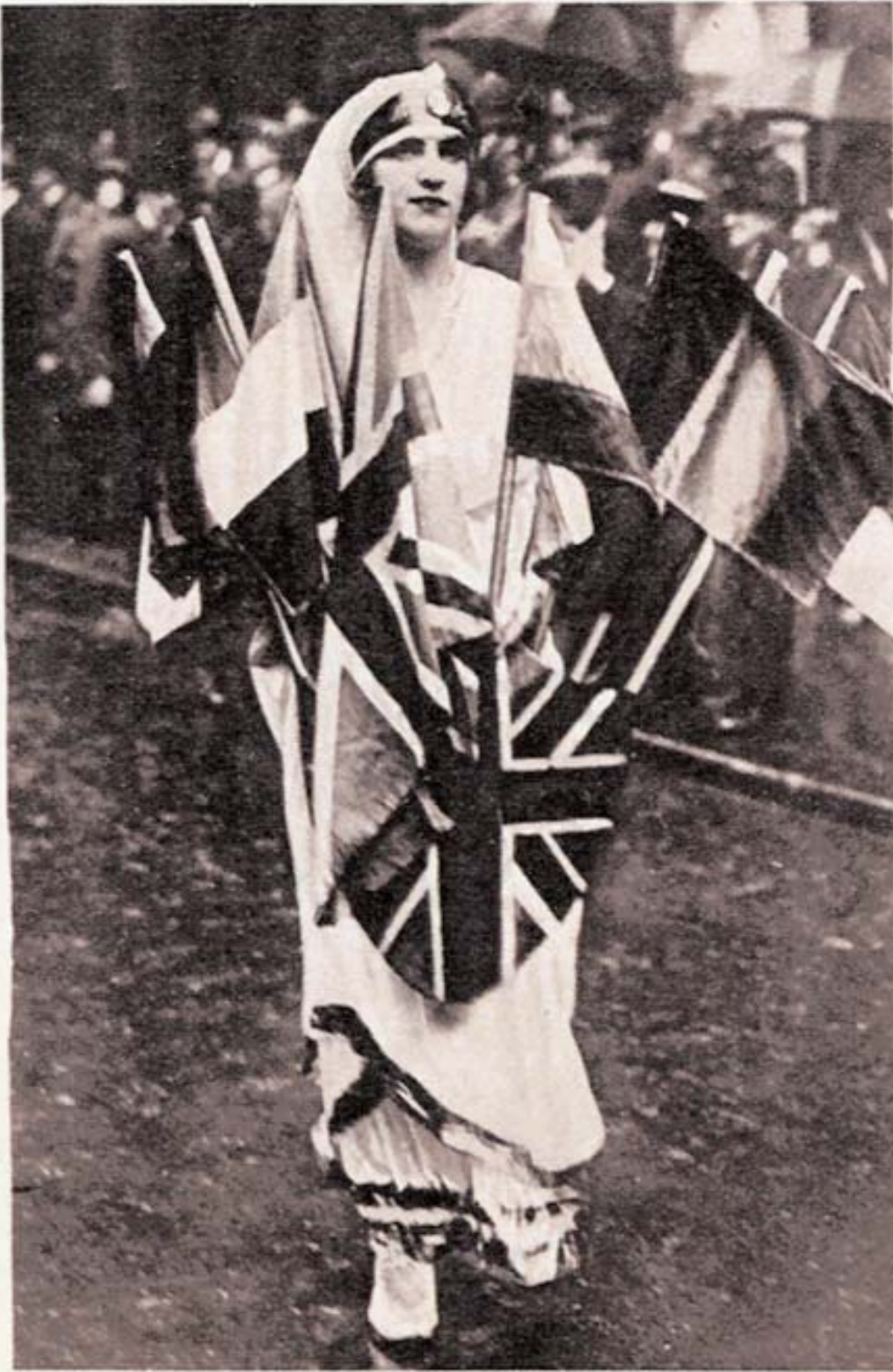
THE ALLIES : THE BEARER OF THE FLAGS OF THE NATIONS WARRING AGAINST GERMANY