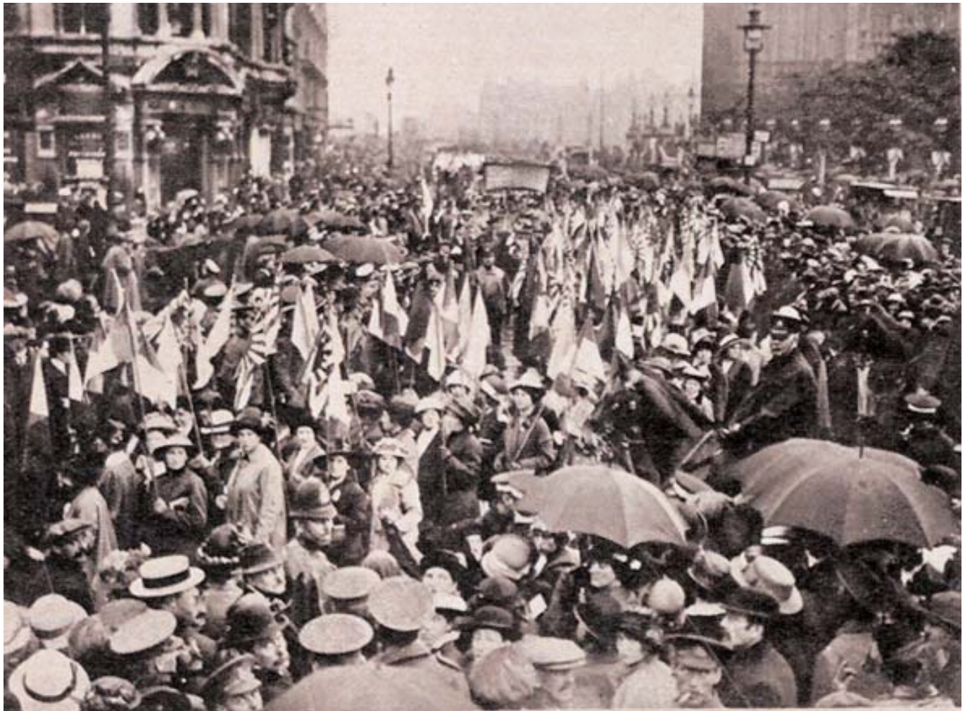
IN A NEIGHBOURHOOD NOTED BEFORE THE WAR FOR MILITANT SUFFRAGETTE DEMONSTRATIONS ! THE PROCESSION IN THE SHADOW OF THE HOUSES OF PARLIAMENT.