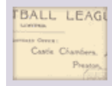
Footballers and National Insurance, 1912