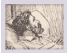
Poster on National Insurance, 1911