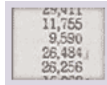
Extracts from the 'Labour Gazette', 1913