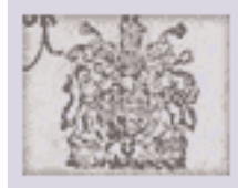
National Health Insurance contributions card