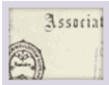
Ironmoulders and National Insurance, 1913