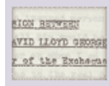
Meeting of Lloyd George and Friendly Societies