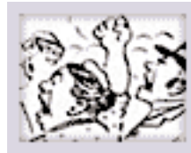
Cartoon on National Insurance, 1911