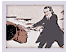
Cartoon on the 1909 Budget