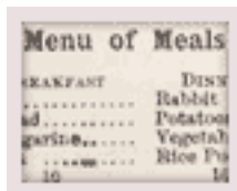
BACKGROUND SOURCE 2 A table showing the weekly diet of a working family in Liverpool. It comes from 'How the Casual Labourer Lives', a study looking at life for the poor in Liverpool in 1909.

Other studies made people and politicians aware that the most vulnerable in society were also often the worst off. When people were too old to work, they had to rely on their family or charity to feed and house them. Children living in the poorest areas were vulnerable to disease, especially in their early years. They were also vulnerable to exploitation. Employers used child labour because children were cheap. Sometimes even parents forced their children to work because they needed the earnings. There were other abuses which children suffered as well, including malnourishment and even violent abuse. It is not surprising that in the poor districts the attendance of the children was very high. For many of these children school was a warm, safe place compared to home and work.