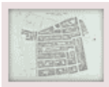
BACKGROUND SOURCE 1 A plan drawn in 1900 showing packed and unsanitary working class housing in the Boundary Street area of Bethnal Green (PRO ref: PRO 30/69/1824)

Social reformers like Charles Booth (in London) and Seebohm Rowntree (in York) carried out detailed studies into the lives of the poor. Their results were truly shocking. Their studies showed just how many people lived on the poverty line - in York it was over a quarter of the population. The studies also showed just how bad life was for the very poor - terrible housing, poor health, bad diet and an endless struggle just to feed the family.