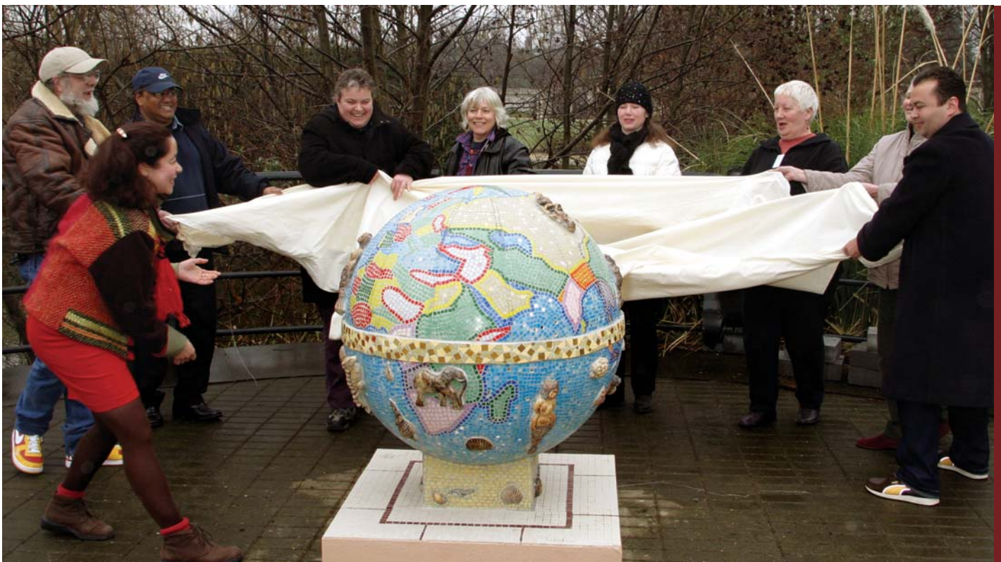
PARTICIPANTS AND PARTNERS WITH THE GLOBE