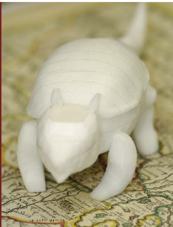
MAP AND ROSALIE'S ARMADILLO