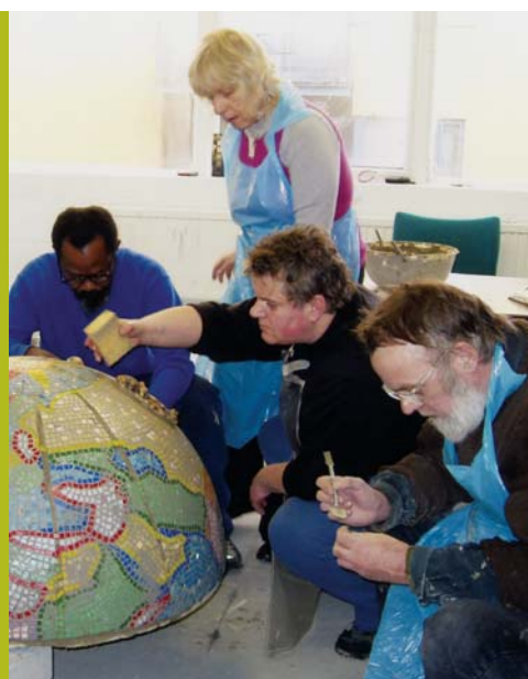
FINISHING TOUCHES TO THE NORTHERN HEMISPHERE