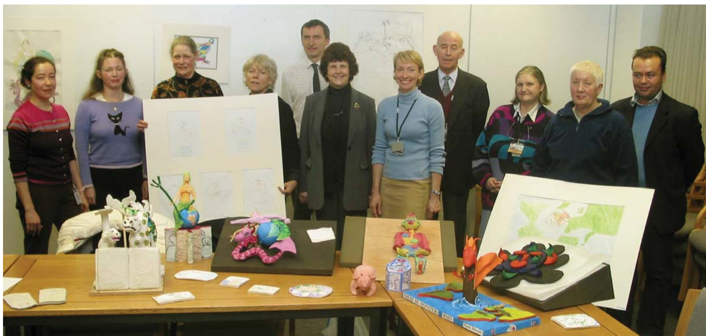
PRESENTING IDEAS TO THE DESIGN COMMITTEE