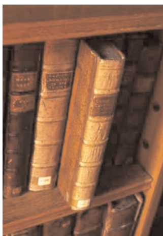
Through prolonged exposure to light these leather volumes are now faded

Unskilled, DIY repairs and indiscriminate rebinding can seriously reduce the value, particularly of rare or special items, and lose irretrievable bibliographic information.