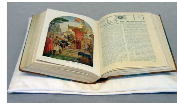
When opening a book on a flat surface, protect the structure from stress by supporting the covers and the spine

The recommendations in this leaflet are intended as guidance only. IPC does not assume responsibility or liability.