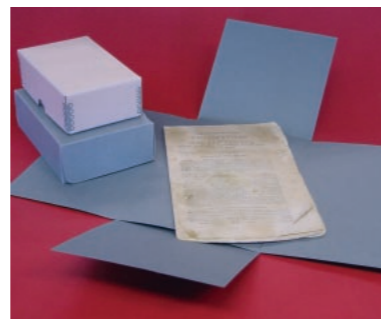
Keeping books in protective enclosures will help to prevent physical damage