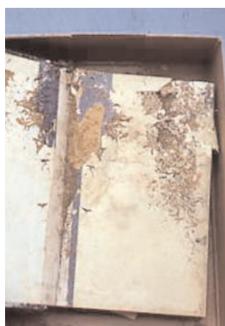
High levels of relative humidity will encourage mould growth