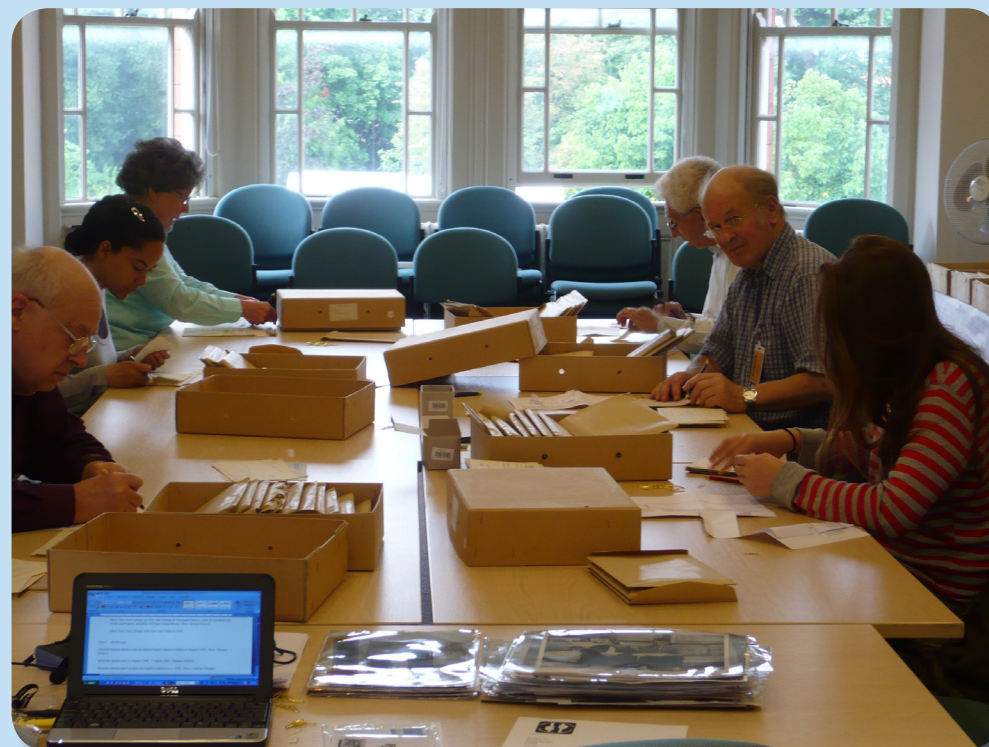
▲ Volunteers sorting the Macmillan Publishers Correspondence, University of Reading, August 2010