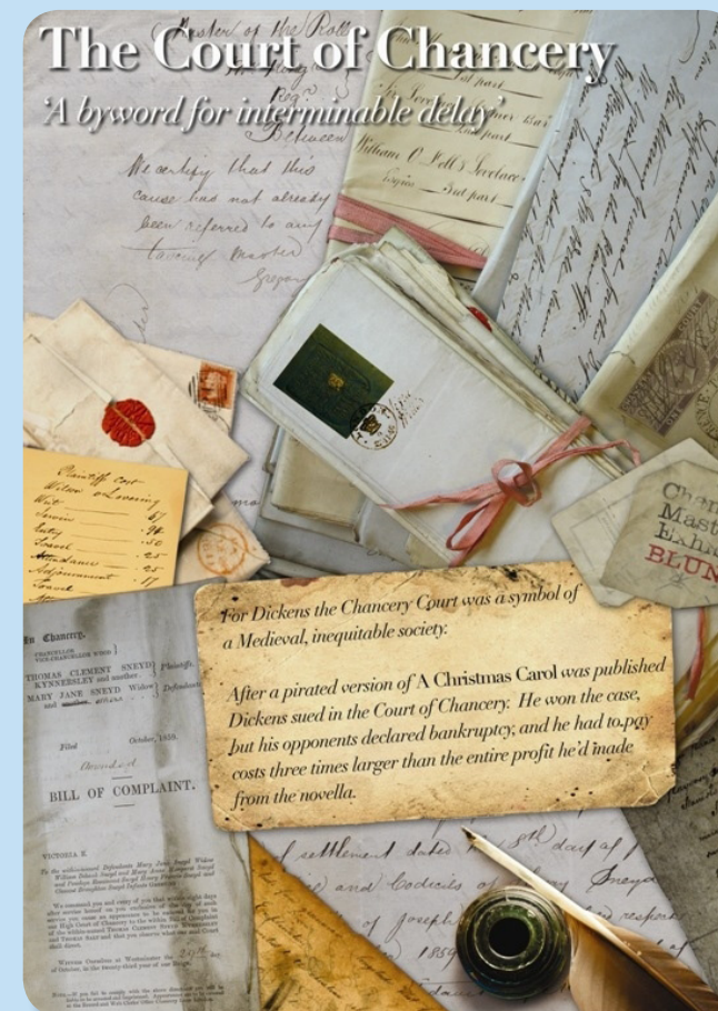
▶ A panel produced by the New Vic Theatre using historical documents supplied by Staffordshire and Stoke-on-Trent Archive Service