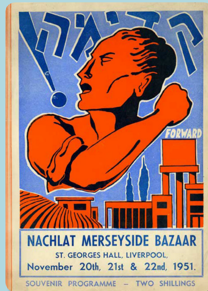
▲ A programme for the Nachlat Merseyside Bazaar, 1951, (reference 296 JNF)

'By cataloguing these records they have provided a fascinating story, not just for the Jewish community to research and follow, but anyone around the world interested in social history.'