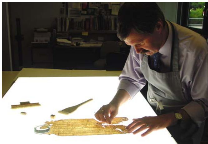
Conservation treatment on a document

Donations from the Friends have helped The National Archives to undertake its vital work safeguarding the national memory.