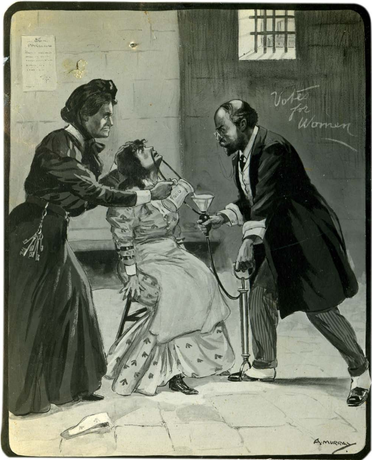
Image of a Suffragette being force-fed.