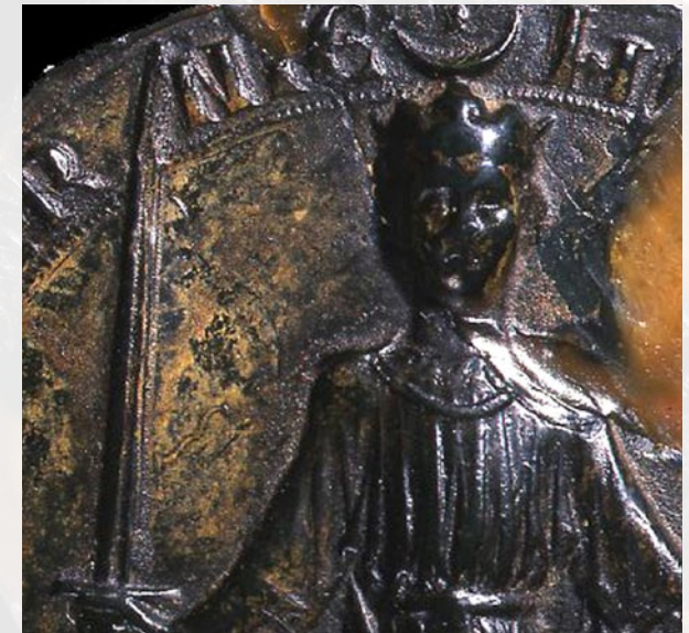
First Great Seal of Henry III (TNA ref: E42/315)

A one-day conference examining England during the Barons' War (1258-1267)