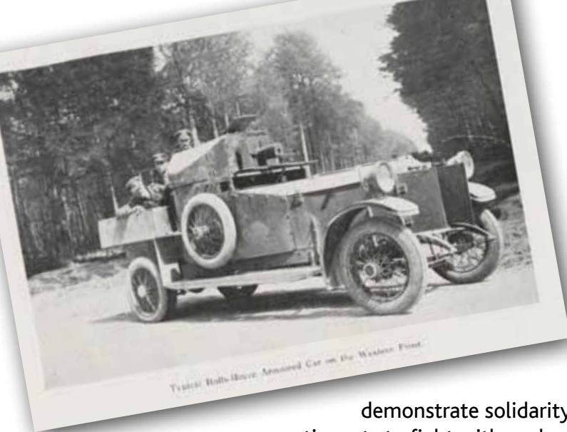
◀ MUN 5/165/1124/45: Rolls Royce Armoured Car.

demonstrate solidarity, had sent various contingents to fight with each other's armies, and a