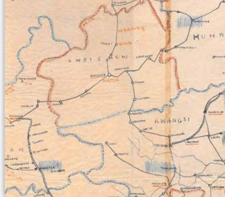
▲ HS 1/293: section of a map of China showing resources and key areas.

Unfortunately, inflation in China was so high and the official exchange rate was so poor that buying rubber proved impossible. However, black market Chinese National Dollars (CND) cost only one-fifth as much, and the Mickleham team made a persuasive argument for pursuing black market financial dealings. 4 Mickleham was discontinued, having produced no rubber, and the team was set to work on such currency dealings: 'Operation Remorse'. The objective was to buy CND on the black market at favourable rates and channel the money to British organisations in China, including SOE, the British Military Mission – and the Secret Intelligence Service (SIS, or MI6).