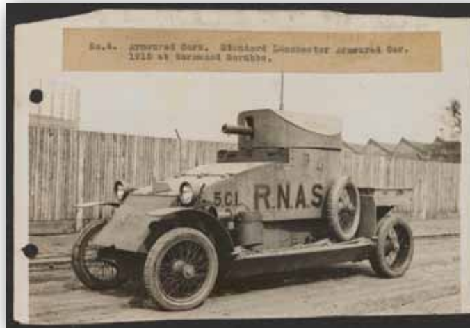
▲ MUN 5/394: Standard Lanchester Armoured Car.