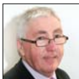
John Gray Digital Content