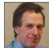
David Lammy Northern Ireland