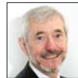
James Eric Davies Library and University Community